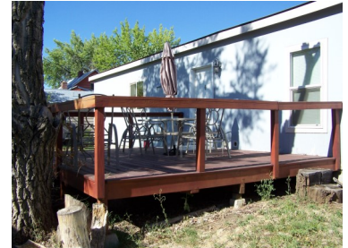
Fun outdoor deck.